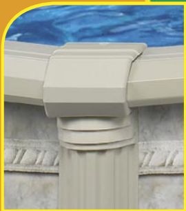
Form Fitting Support Cap

The sturdy DYNASTY khaki colored pool frame consists of a wide, 8-inch extruded resin ledge, coupled with a 7-inch extruded resin post and topped with a three-piece injection molded resin cap and post collar.