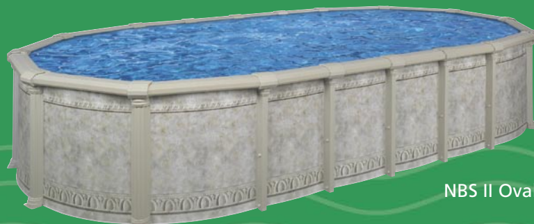
NBS II Oval

Whatever size of property you have, there's a DYNASTY pool to fit your yard and your budget. Choose from a wide variety of Round, A-Brace Ovals or NBS II and NBS II EXP Ovals and beat the heat this summer!